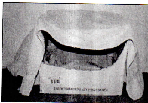
making a whelping box for your pet.